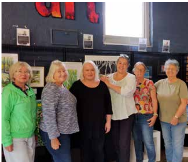
Daylesford Regional Arts Cooperative members with their displayed work at the Visitor Information Centre, Daylesford

The Gender Equality Act 2020 requires local government to take positive action towards promoting gender equality in their policies, programs and services. A Gender Impact Assessment has been completed in line with the development of this strategy to enable accompanying actions to be inclusive and promote equity.