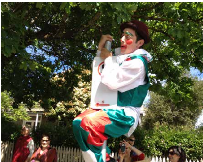
Swiss Italian Festa

The Hepburn Shire Events Strategy 2020-2025 seeks to bring Hepburn Shire's arts and culture to the forefront of Hepburn's visitor economy. The events strategy presents a clear vision for Hepburn Shire to become a premier Regional Victoria Events destination. The strategy aims to attract, retain, and grow events across the regional tourism brand pillars of Indulge (Food and Drink), Refresh (Escape and Rejuvenate), Learn (History and Culture) and Make (Art and Artisans). While the events strategy supports the promotion of major annual tourism events, there is an opportunity to bring awareness to smaller events in other areas of the Shire that have not been able to garner the same level of engagement.