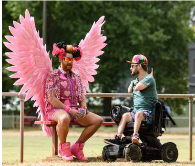
Wings and Wheels at Chill Out Festival 2023

People wanted to see arts and culture represent the diverse heritage and stories of Hepburn Shire. Some emphasised how it was important to move away from limiting the identity of Hepburn Shire to 'farming and the gold rush'.