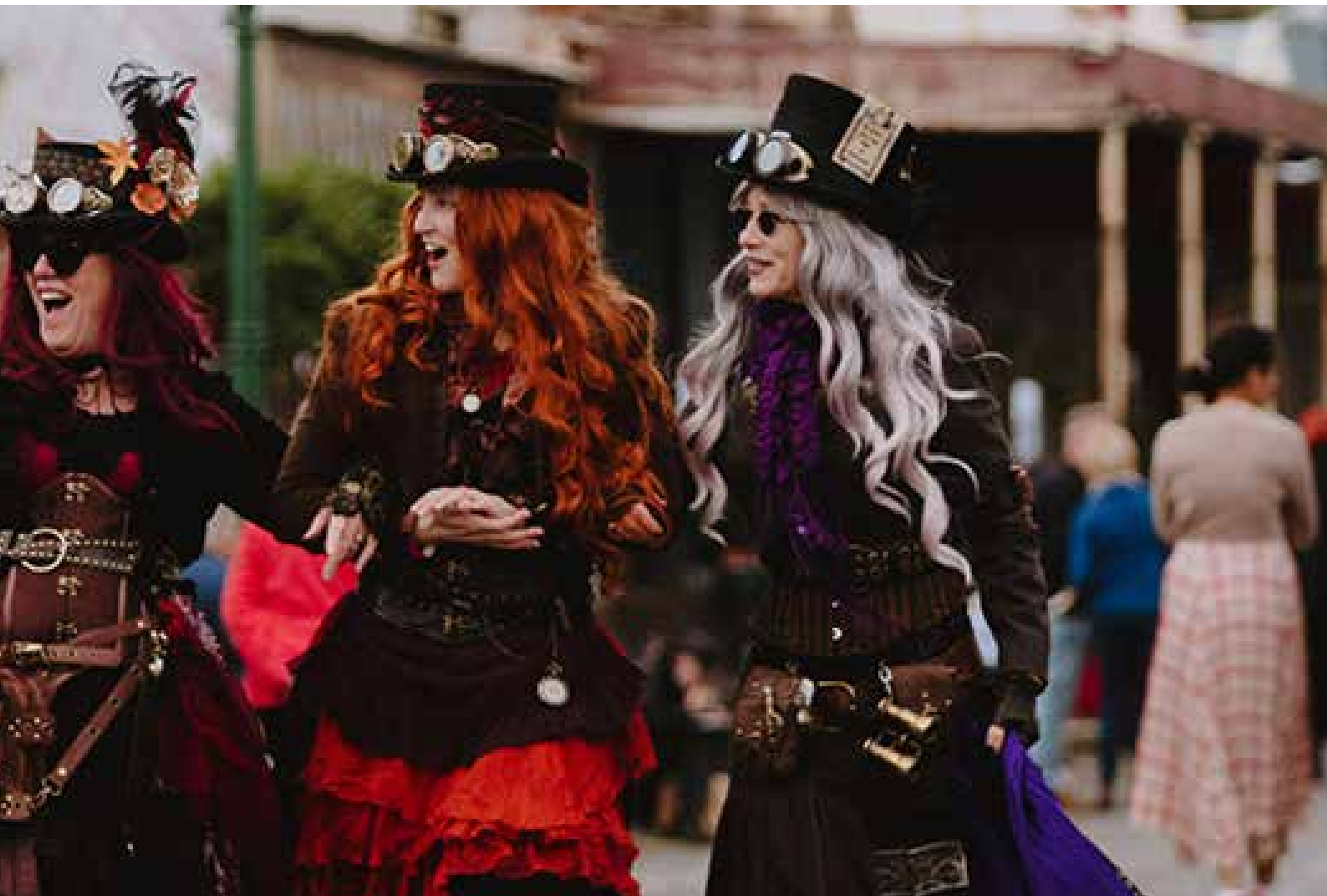
The Brass Harpies celebrating culture and storytelling at the Clunes Booktown Festival