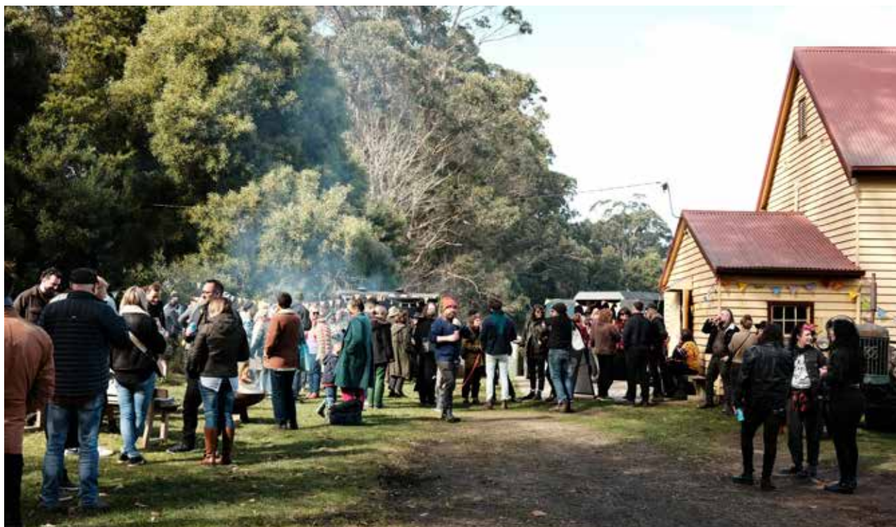
Winter Sounds at Bullarto