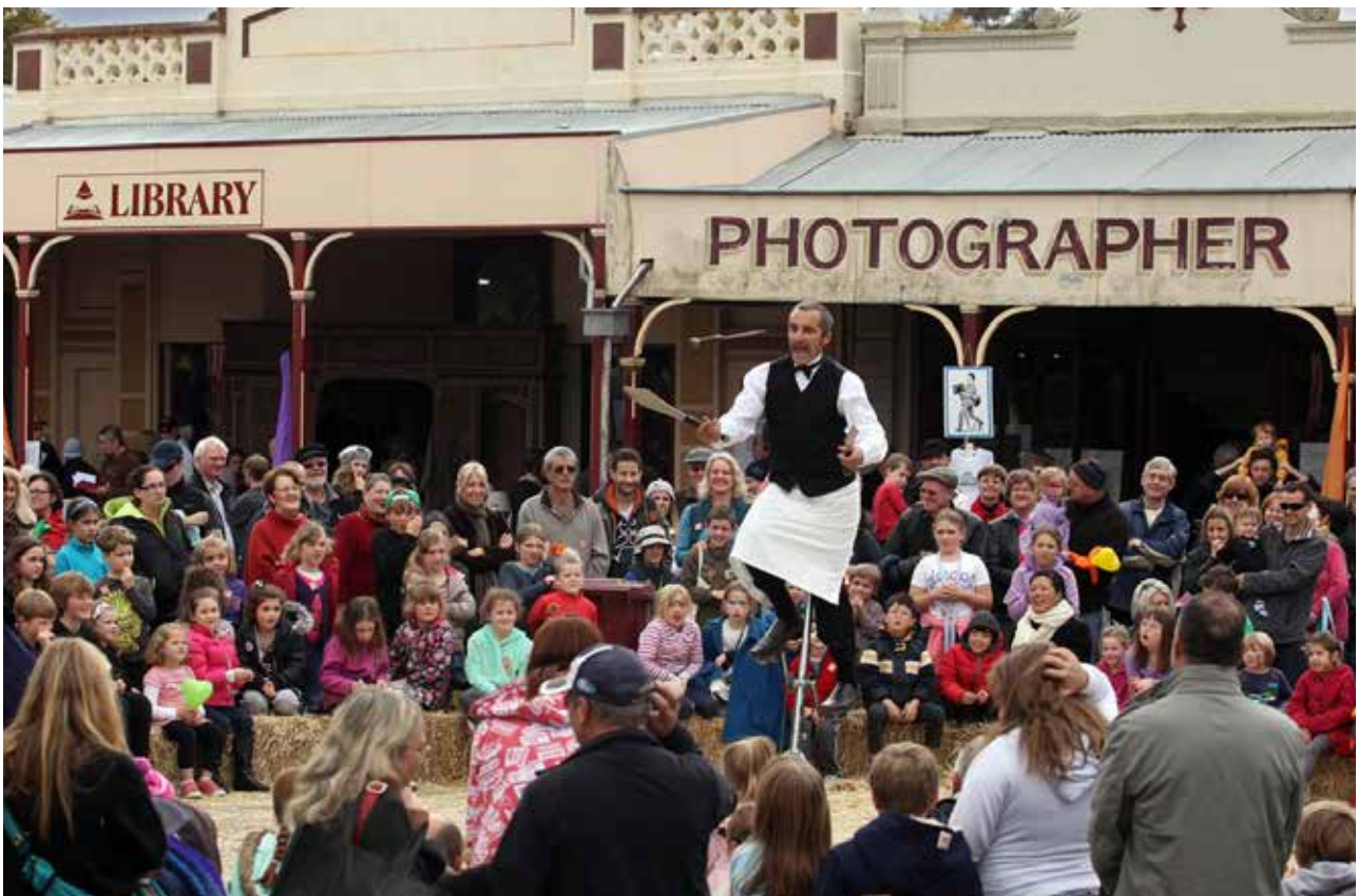
Clunes Booktown

Throughout these conversations, a common theme emerged: the profound influence of art and culture on all aspects of our lives, from our sense of identity and connection to our overall well-being.