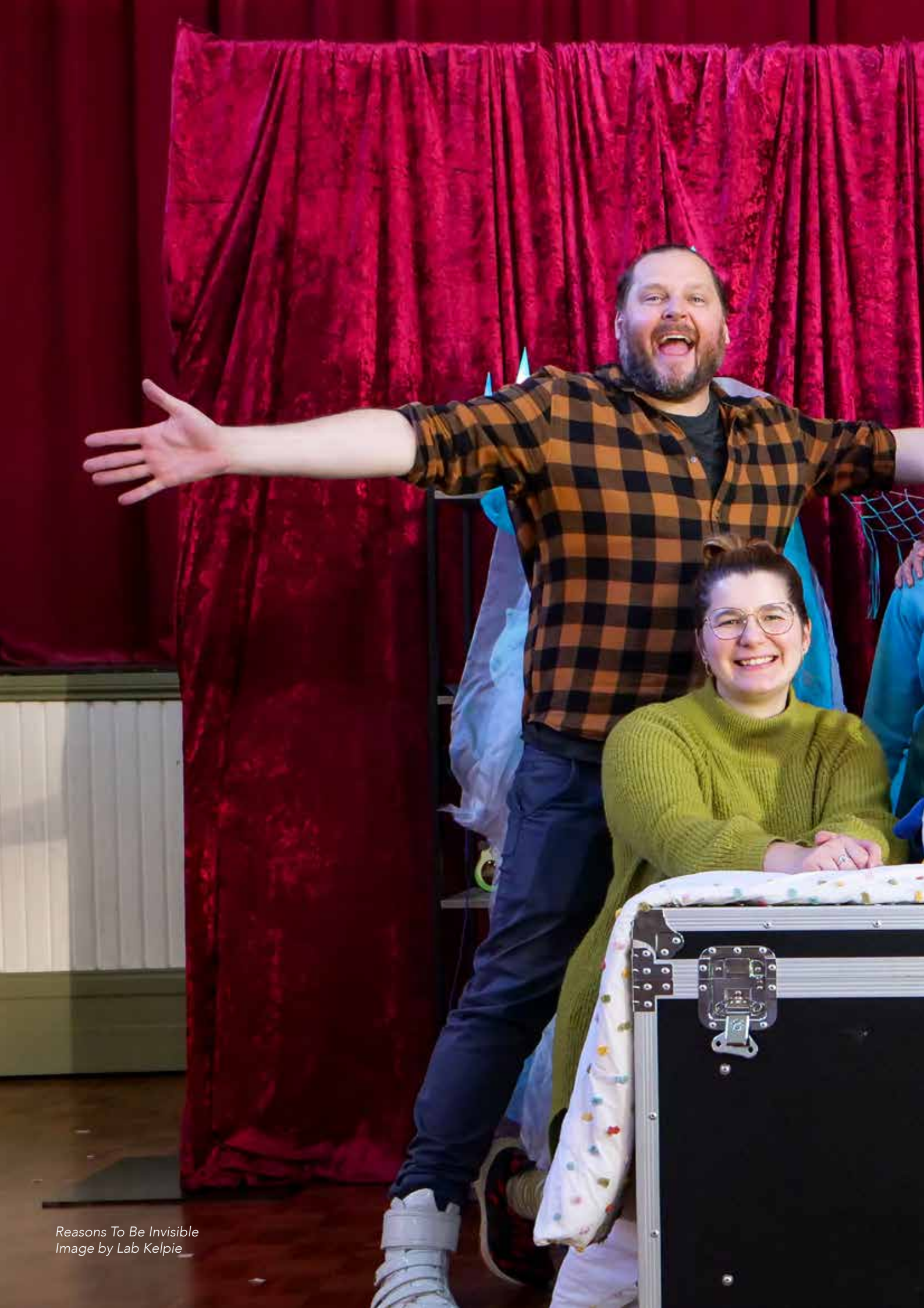
Reasons To Be Invisible Image by Lab Kelpie