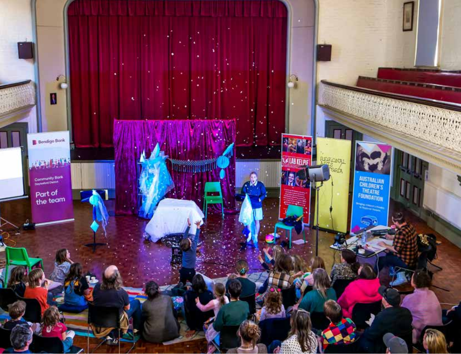
Reasons To Be Invisible Image by Lab Kelpie