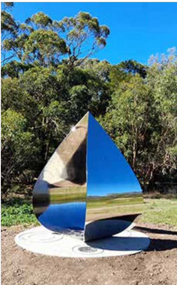
The Drop in Glenlyon Artist: Yu Fang Chi

"Hepburn Shire – an inclusive rural community located in Dja Dja Wurrung country where all people are valued, partnerships are fostered, environment is protected, diversity supported, and innovation embraced."