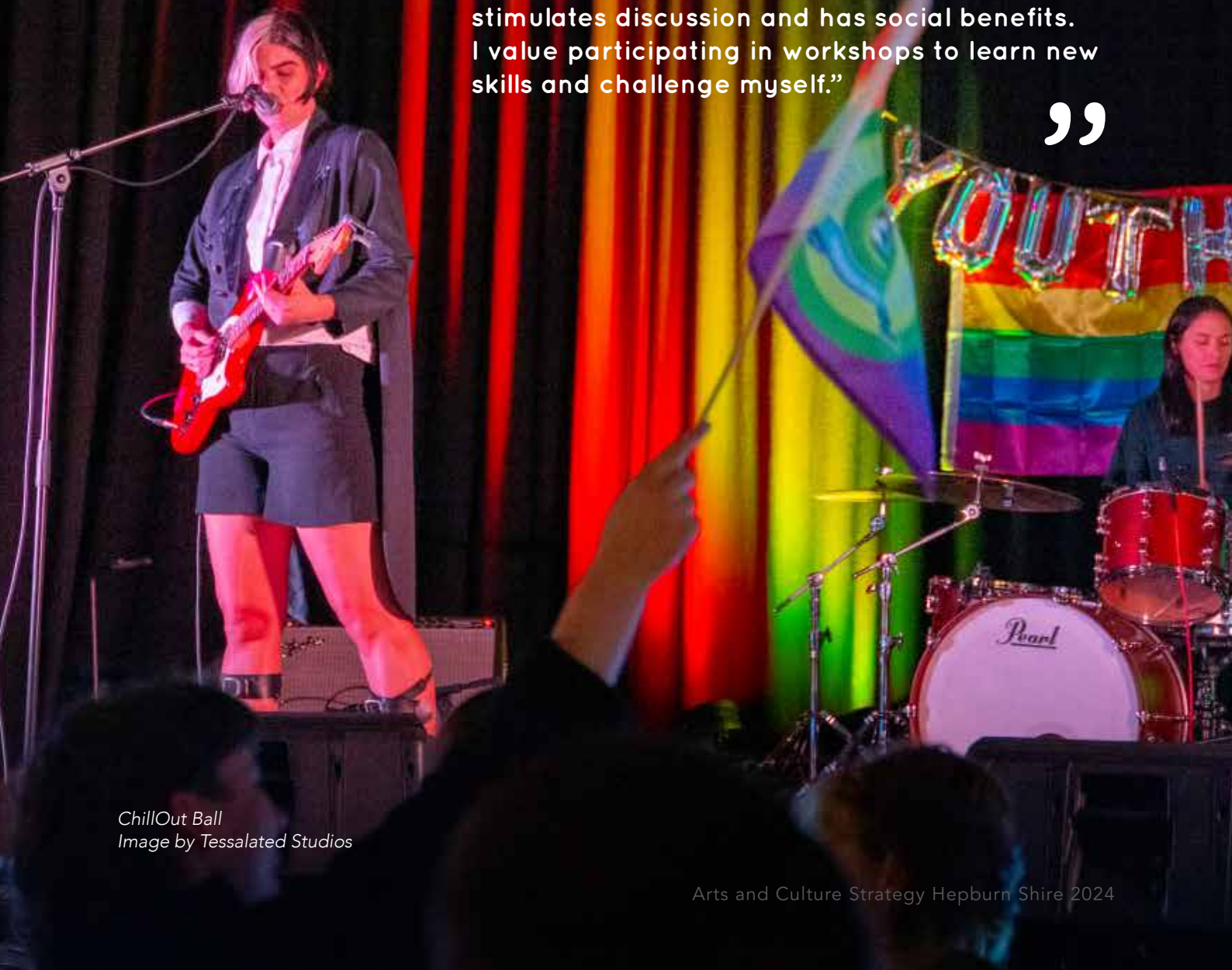
ChillOut Ball Image by Tessalated Studios